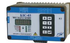
Protection Unit BZS-03

It is aimed for high-speed protection of equipment from excessive voltage and overload in mono phase circuits with alternating currents up to 220V, as well as for control over main parameters of the circuit. Maximum output capacity makes 2500W.