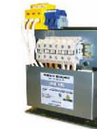
Input Filters FV

It is aimed for high-speed protection of equipment from excessive voltage and overload in mono phase circuits with alternating currents up to 220V, as well as for control over main parameters of the circuit. Maximum output capacity makes 2500W.